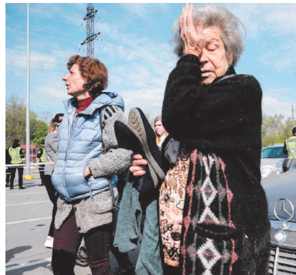
Mother and daughter from Mariupol react as they arrive in their own vehicle at a registration and processing area in Zaporizhzhia on Monday

Just have One Insurance Number, in whatever company you are there, keep availing benefits, every time, everywhere. davn 23119/12/0002/22-23