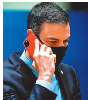
File pic: Spain's Prime Minister Pedro Sanchez phones during an EU summit in Brussels on July 20, 2020

The breaches, which resulted in a significant amount of data being obtained, were not authorised by a Spanish judge, which