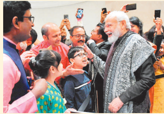
Prime Minister Narendra Modi at an interaction with Indian diaspora, in Berlin, Germany, on Monday

Modi said from the start, India called for an immediate cessation of hostilities and stressed that talks are the only solution to resolve the dispute. "We believe that there will be no victorious party in this war and all will