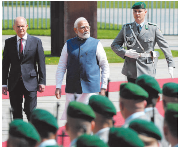
German Chancellor Olaf Scholz, on carpet left, welcomes Indian Prime Minister Narendra Modi, on carpet right, with military honors for a meeting at the chancellery in Berlin, Germany, Monday

well as shared perspectives on regional and global issues with Modi emphasising that the India-Germany partnership could serve as an example of success in a complex world. He also invited German participation in India's Atmanirbhar Bharat campaign.